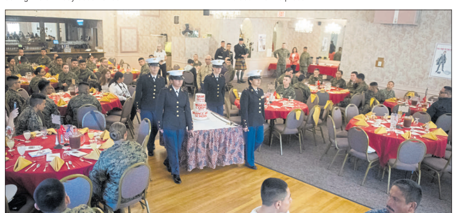
Four Orange High School Marine Corps JROTC cadets rehearse for the Marine Corps' 244th birthday celebration at the Elks Lodge in Orange on Friday.