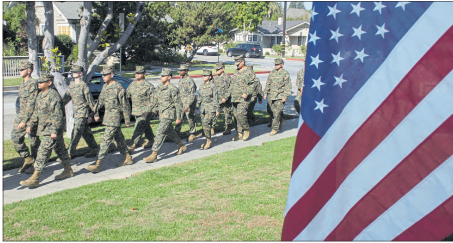
The Orange High School Marine Corps JROTC unit, consisting of 101 cadets, passes an American flag during a march Friday down Schaffer Street to the Orange Elks Lodge to celebrate the Corps' 244th birthday.

After a few years of flagthrough downtown Orange ging interest in the campus' ROTC program, en-The cadets were on their rollment has rebounded. way to a luncheon at the officials said. The cadets, Elks Lodge several blocks they said, are learning away to pay tribute to the leadership skills, personal responsibility and pride of